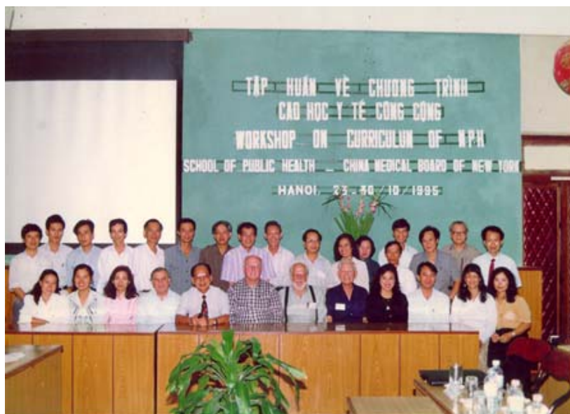
Workshop on curriculum of Master of Public Health Oct 1995

Since 1997, the School has been officially assigned by Ministry of Health and Ministry of Education and Training to give pilot courses for MPH for the very first time in Vietnam. With twenty-four MPH students for the first year, the School embarked on a significant challenge for a beginning program.