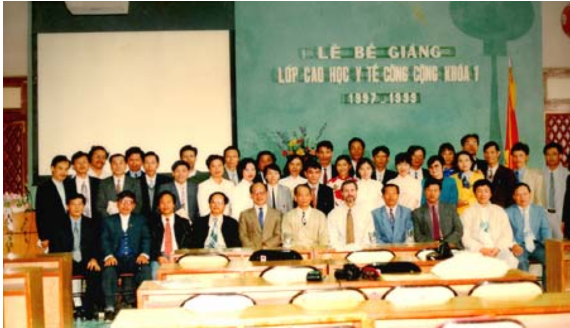
The first MPH class graduated from the school in 1999

For the MPH graduates, the School has made special efforts in maintaining the alumni relationship with them through continuing education program and providing technical support. This is being facilitated through the use of portable computers (partially subsidized by the School) and email connections that the students were provided with. Annual workshops also are held for the graduates to share experiences of success and failure, learn about new ideas and opportunities, report on their scientific research conducted and contribute to the continuing improvements of the curriculum.